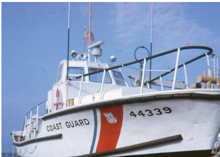
US Coast guard 44' Patrol Boat