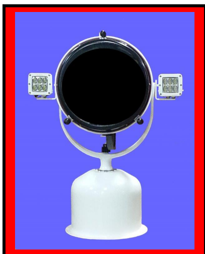
“Wall of Light” aimed instantly on demand!

What is a “Hybrid Searchlight”? Carlisle & Finch has created the “LED Hybrid” Feature. This feature adds auxiliary LED’s to a 12 or 15-inch halogen searchlight, creating a “Hybrid Searchlight”, which utilizes the strengths of multiple lighting technologies on demand!