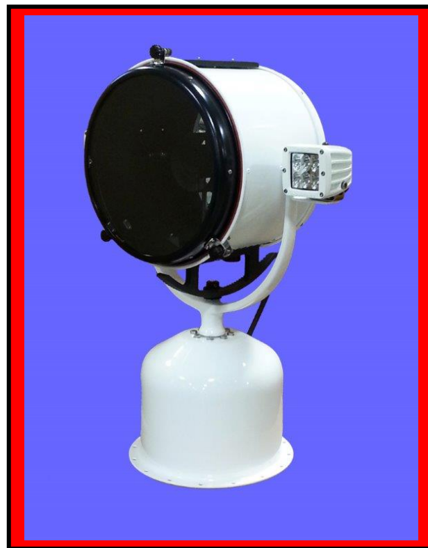
12-inch Halogen Searchlight with auxiliary LED’s seen above