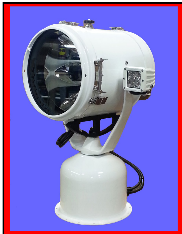
350 Watt Xenon Searchlight with auxiliary LED’s seen above