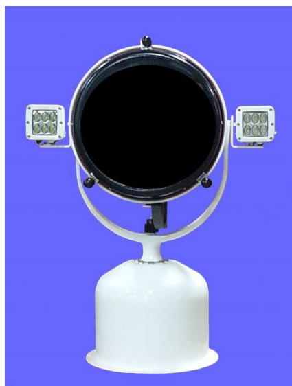
“Wall of Light” aimed instantly on demand!

What is a “Hybrid Searchlight”? Carlisle & Finch has created the “LED Hybrid” Feature. This feature adds auxiliary LEDs to a 12 or 15-inch halogen searchlight, creating a “Hybrid Searchlight”, which utilizes the strengths of multiple lighting technologies on demand!