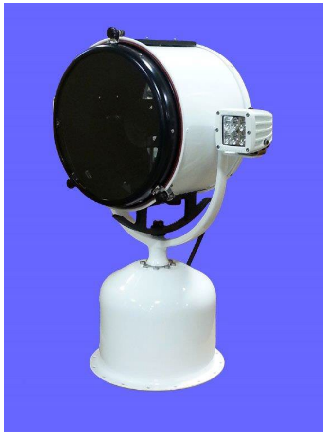
12-inch Halogen Searchlight with auxiliary LEDs